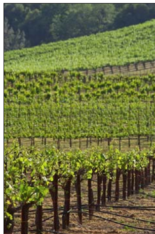
Amador Vineyard in Spring

The Sierra Foothill wine region of the central California valley is generally east of San Francisco and includes the El Dorado and Amador County wine growing regions. More than 100 wineries are located in this area with vineyards generally located between the elevation of 1,500 to 3,000 feet. The shallow, mountainside soils create moderate stress on the vines, producing low to moderate yields and high quality. The region has rolling, sun-drenched hillsides, warm climate, and volcanic, decomposed granite soils, which are ideal conditions for producing quality wine grapes.